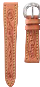
Curved Leather (Saddle Leather)