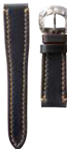
Cordovan (horse butt leather)